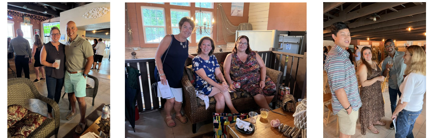
Party on the Patio